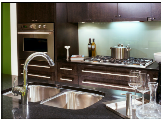
U-5050 shown undermounted in granite.