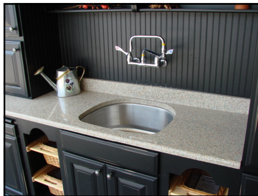
U-2321 shown undermounted in quartz.